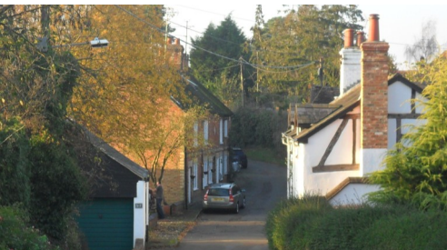
3. Burcott High Street