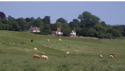
7. Ancient Garden Terraces at Lower Ascott