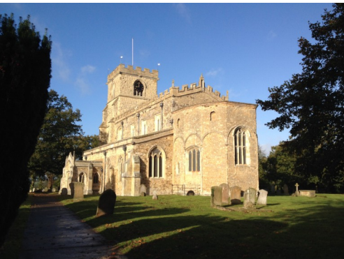
1. Wing church